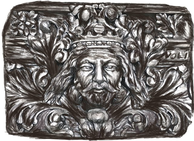
Rory O'Connor ( Ruaidrí Ua Conchobair )