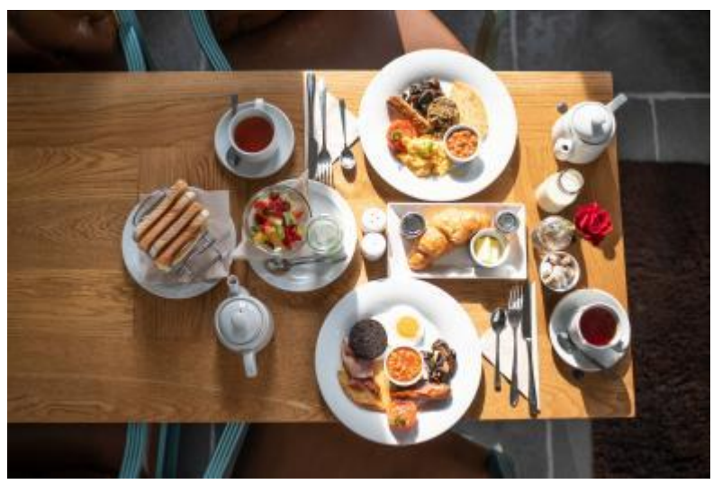
The Skye Inn breakfast