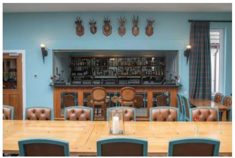
The Skye Inn bar