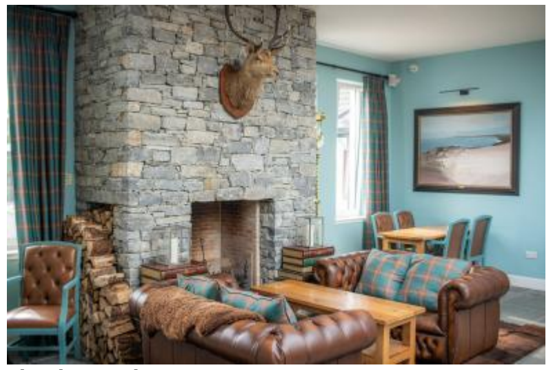
The Skye Inn lounge area

• From the main entrance to the lounge, there is level access. The route is 1800mm wide, or more. The door is 1800mm wide.