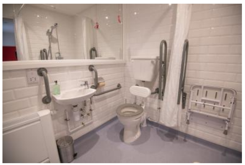
The Skye Inn accessible bathroom