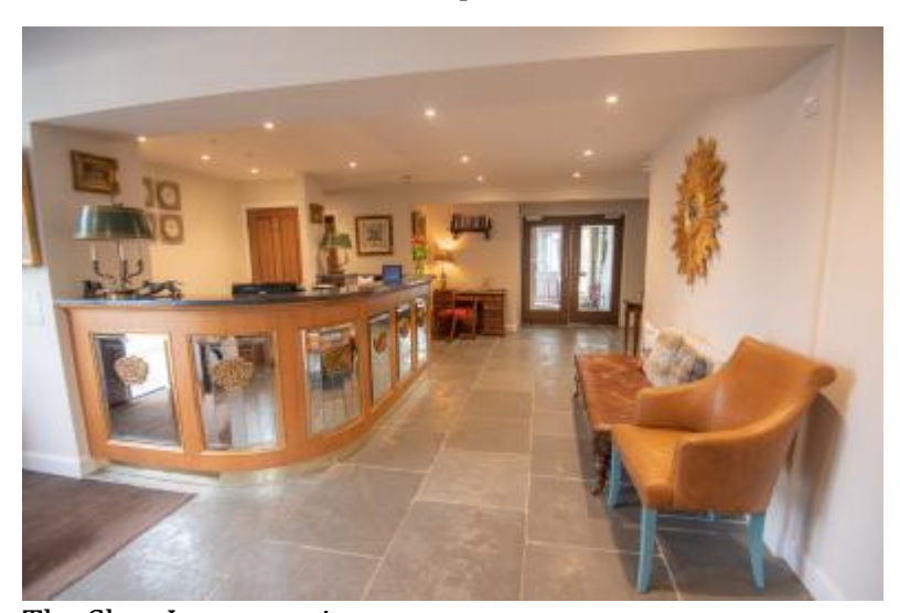
The Skye Inn reception