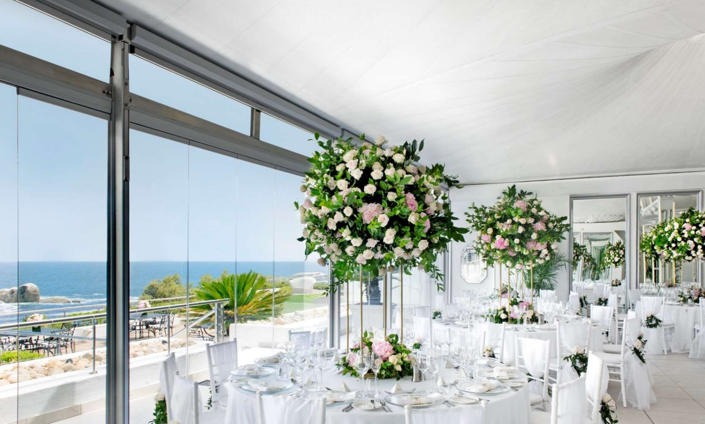
DINING WITH A VIEW